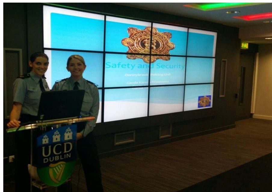
Community Gardaí presenting at UCD Student Services Centre, advising Students to be mindful of their Personal Security & Welfare while attending at University College, Dublin.