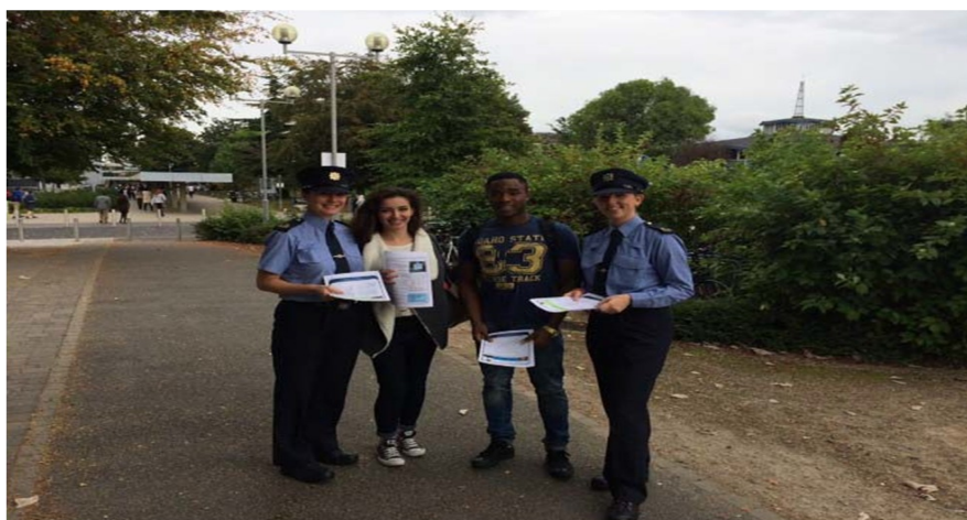
Community Gardaí interacting with and distributing Personal Safety leaflets to members of the Student Population at University College Dublin.