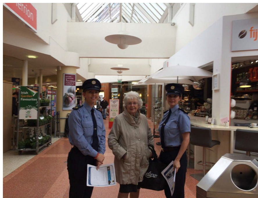
Community Gardaí interacting with and distributing Crime Prevention leaflets to members of the Community at Merrion Shopping Centre, Dublin.