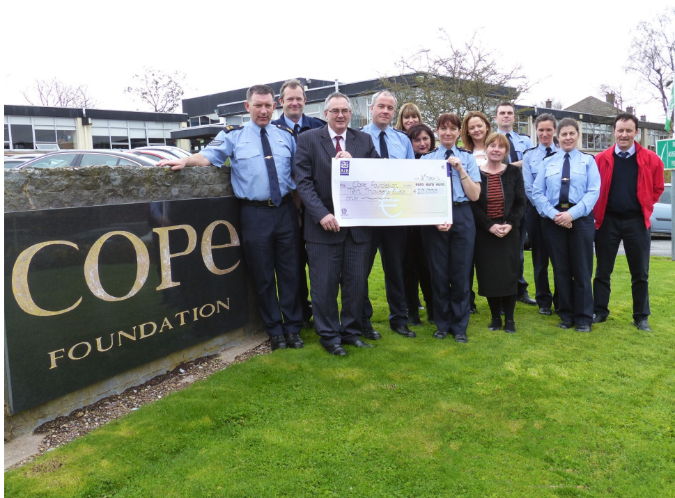
Pictured, Community Policing Mayfield handing over a cheque for €10,000 to the Cope Foundation.