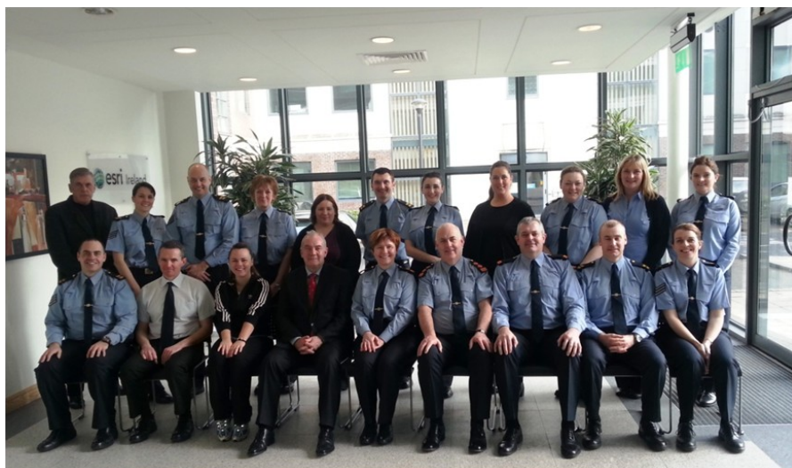
The Change Management Team

During 2014, the Change Management Section implemented a number of large scale change initiatives to enhance the efficiency and effectiveness of Garda policies and practices, and ensure standardisation of approach throughout the organisation.